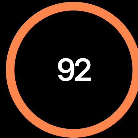
Sponsor Satisfaction Rate