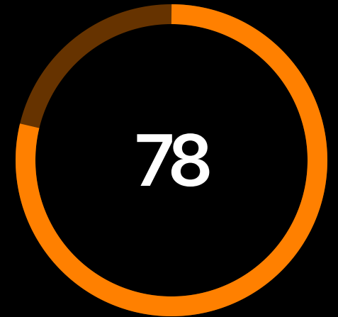
Return on Investment